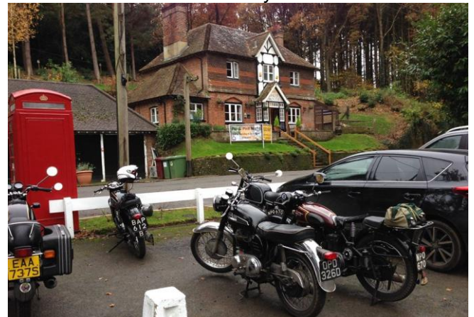
Dry finish at the Moles, Selham