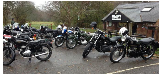
Wet Whiteways start

This was my first run as leader, I thoroughly enjoyed the whole process and I was especially pleased to run along a couple of roads completely new to Goodwood. I also really appreciate the support of the 13 which turned out from Brooklands, South Hants and of course the many from Goodwood.