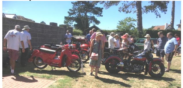
L – Moto Guzzi Galletto R – 1942 Harley Davidson Model U

Approximately 500 paying visitors came through the gate on the Sunday, just a few less than their Summer Fete, which is usually the best number of visitors. So didn't they do well !