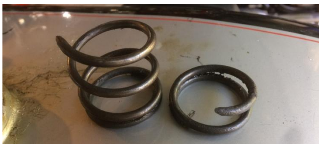
Broken inlet valve spring

Dave and I are planning to repeat the run next year and would like to extent it to other members of the Goodwood and Brooklands sections, and others if there is enough interest. Hope to see you all for a night out in Devon next year. Mileage a little over 400 miles