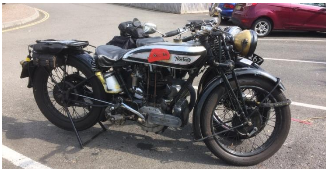
Missing a knee grip. Looks sporty with a splash of red?